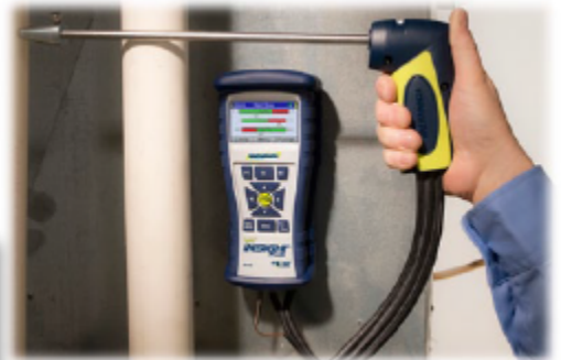
As easy as 1-2-3: Select fuel type, select appliance type and then start analysis.